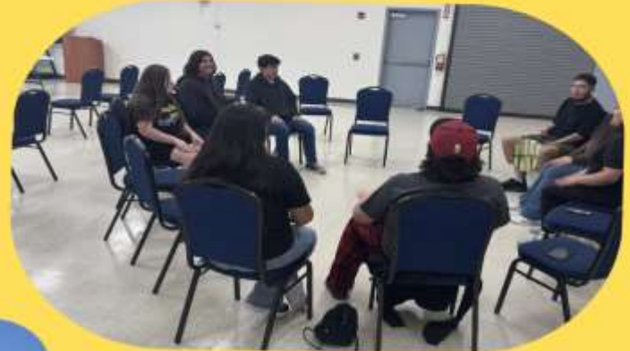
Teen Night Hand Games