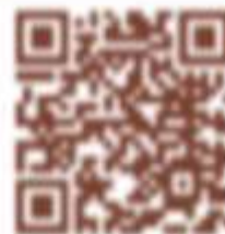
Scan QR to Vote