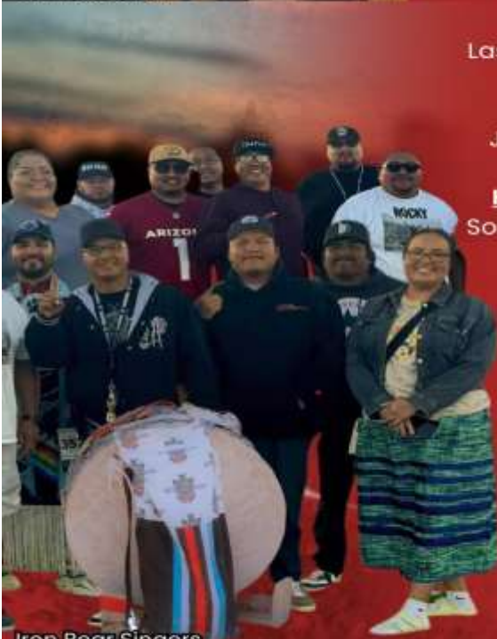
Iron Bear Singers